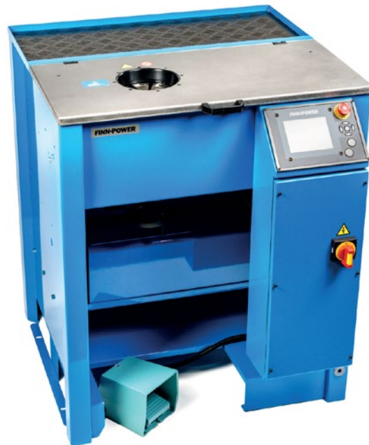
FINN-POWER NC60 CRIMPING MACHINE FOR SERIAL PRODUCTION

UC STRAIGHTFORWARD CRIMPING CONTROLLING.